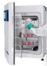
Service of CO2 incubators