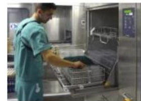
Service and inspection of washers