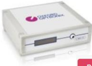
Oxford Optronix Rent OxyLite system