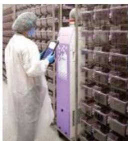
Service and calibration of IVC from Tecniplast, Allentown, Ehret, Zoonlab