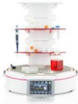
Oxford Optronix Rent the HypoxyLab station