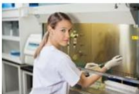
Laminar cabinets service