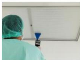
Integrity measurements of HEPA and ULPA filters, DOP tests